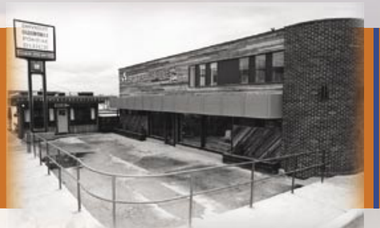
right: Salmon Arm Motors 1976