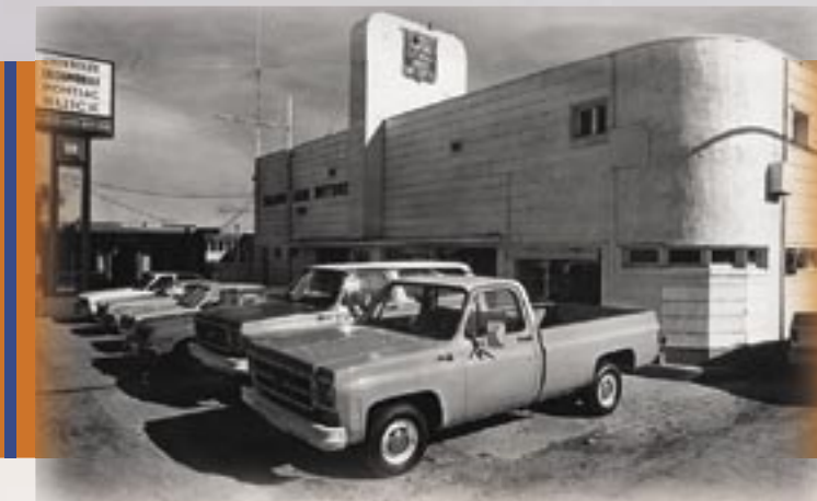
left: Salmon Arm Motors 1960