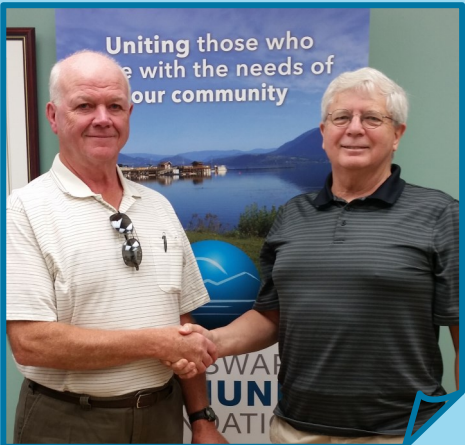
Seniors Resource Centre-Fletcher Park