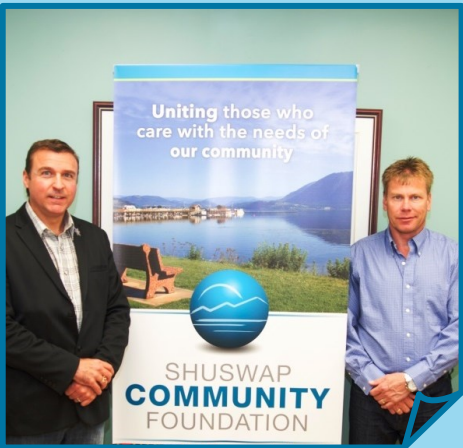
Kyllo Family Endowment