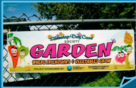
Project: Shed Replacement & Garden Area

Shuswap Daycare Society recently received a grant from SCF to replace the old shed on their property and to purchase four vinyl garden boxes for the garden area. Two sheds were built and finished, one for the children's play equipment, and the other for gardening supplies. This grant also enabled the Daycare Society to involve the children in the project-enriching the children's diets and teaching them to care for their gardens, as well as observing, comparing, and counting vegetables. This grant was made possible by the Wainwright Mobley Family Fund.