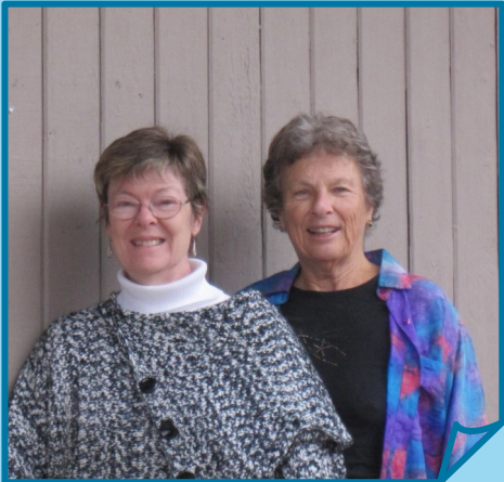
Shuswap Theatre Society Endowment