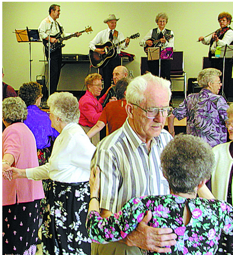
The foundation supports the Branch 109 Seniors Activity Centre and all it offers to the older generation.

The donation of a life insurance policy can be part of an overall financial and planned giving program. If this strategy is of interest to you, discuss it with your financial advisor or life insurance professional.