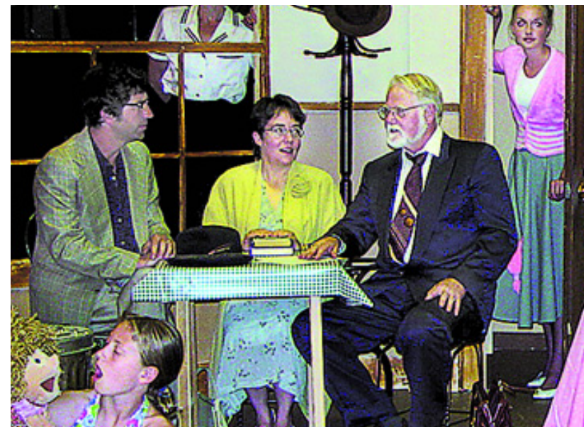
The Shuswap Theatre (a recent production rehearsal is shown above) is a recipient of funding from the Foundation.

The Foundation maintains a Memorial Book containing pictures and brief biographies of all Founders and all persons in whose name memorial tributes have been made. If you have made a memorial contribution, please help us by contributing material for the book!