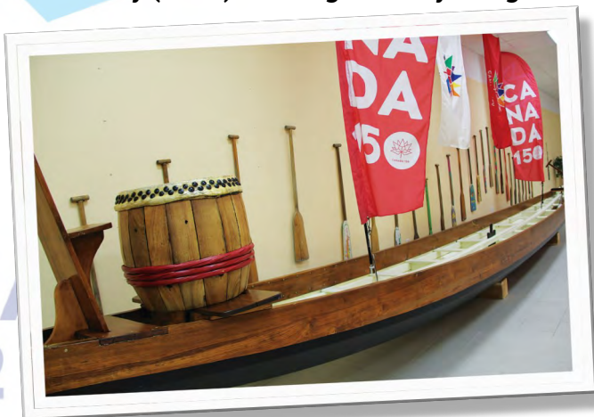
Aspiral Youth Partners Celebrate the Dragons