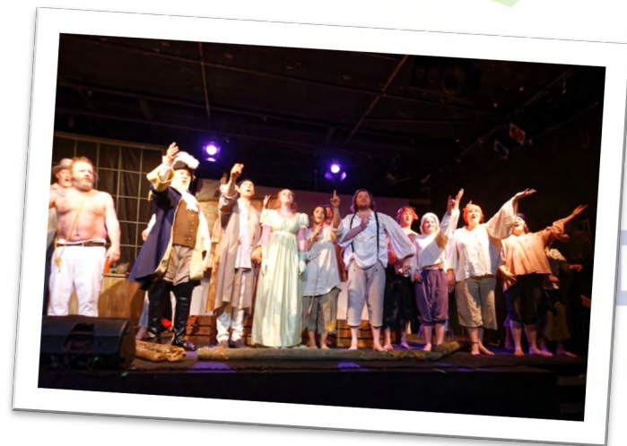
Shuswap Theatre 2017 Okanagan Zone Drama Festival

“Volunteers are at the heart of strengthening civic engagement, fostering social inclusion and ernance with Community Foundations of Canada. “The participation of volunteers in 2017 acti ry. We’ve seen tens of thousands of volunteers from all corners of the country come together