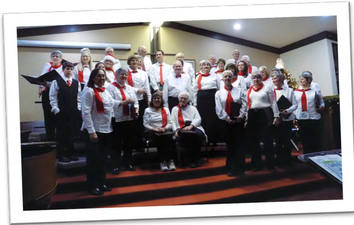
Shuswap Singers Canada 150 Celebrates Shuswap Choral Gala 2017

The goal of the fund was to engage as many local community groups as possible in a wide range of local projects