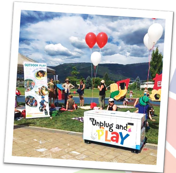
Shuswap Children's Association Unplug & Play Box