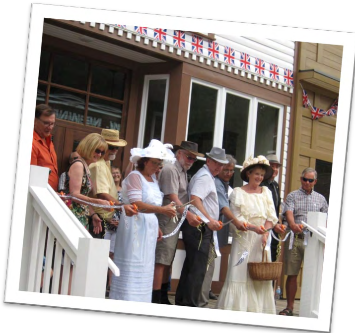
Salmon Arm Museum and Heritage Association –Grand opening of Montebello Museum