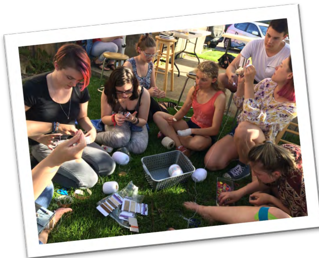
Shuswap District Arts Council Canada 150 Artist Journal