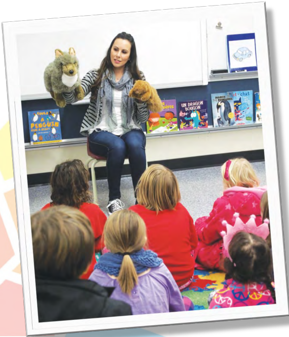
Literacy Alliance of the Shuswap Society (LASS) – Aboriginal Storytelling

SCF funds were matched by the Community Fund for Canada's 150th. 13 grant applications were approved and a total of $16,100 (SCF $8,050 and CFC $8,050) was awarded to non-profits throughout the Shuswap.